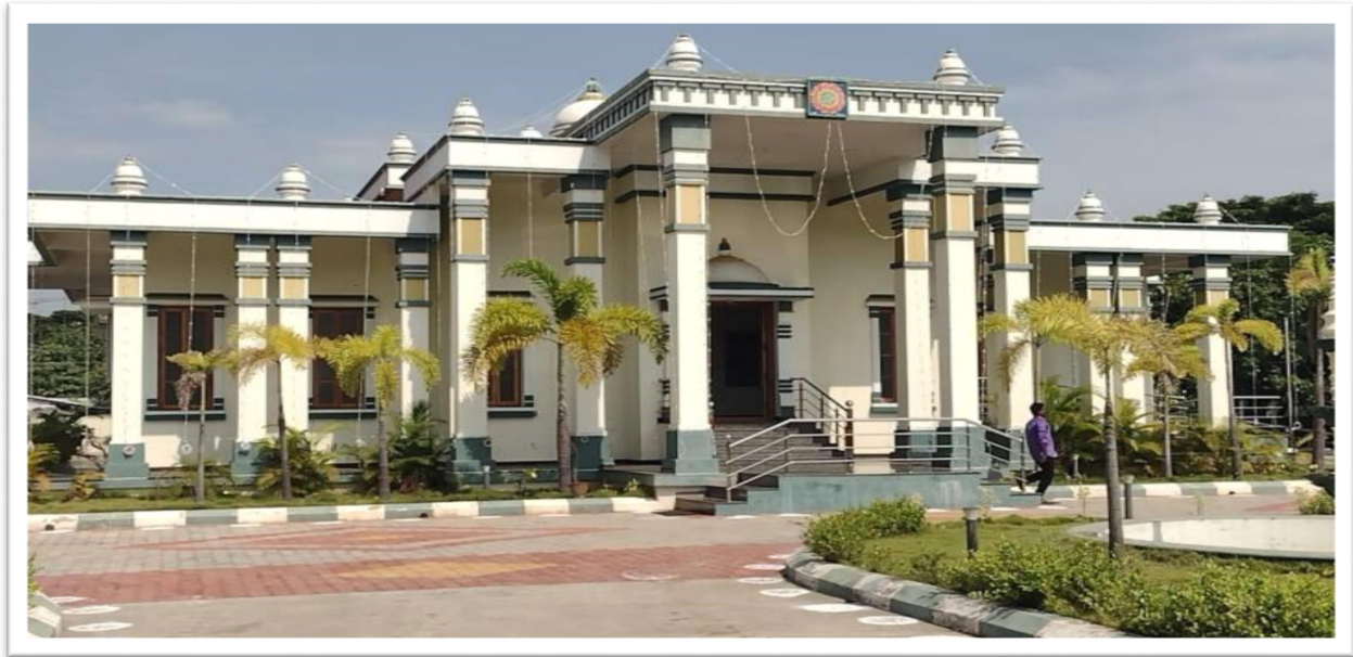
Fig.4 Manimandapam of S. S. Ramasamy Padaiyatchiyar – A memorial honoring his contributions to Social Justice, Agriculture, and Political Leadership in Tamil Nadu.

He founded the Tamil Nadu Toilers' Party in the 1950s, fighting for the rights of the most backward classes. A memorial (mani mandapam) was built for him in Cuddalore. The memorial is situated in the heart of Cuddalore city, Tamil Nadu. It was opened on 25 November 2019 by the then Chief Minister of Tamil Nadu, Edappadi K. Palaniswami.