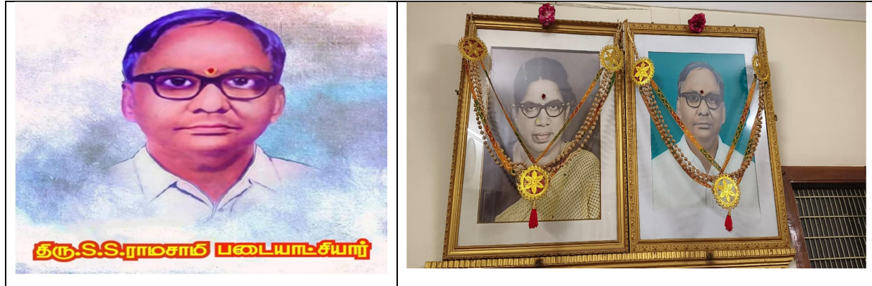
Fig.2 The Legend S.S. Ramasamy Padaiyatchiyar – Social Reformer and Political Leader (1954)

Among these emerging political forces, the Tamil Nadu Toilers Party played a significant role in voicing the concerns of the working and backward classes. Under the leadership of S. S. Ramasamy Padaiyatchiyar, the party became an important platform for advocating social justice and community empowerment.